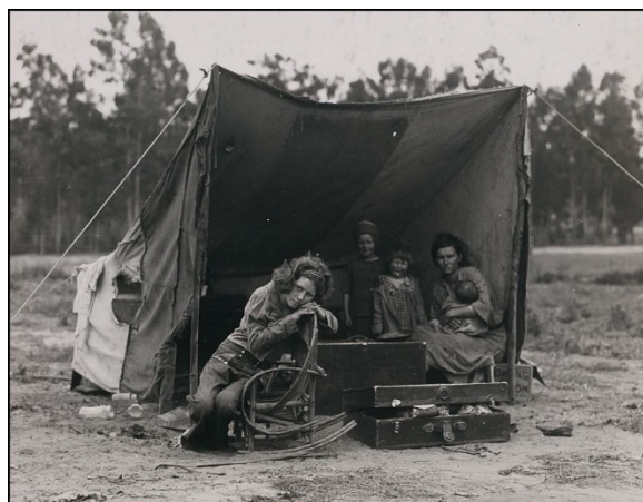
Migrant agricultural worker's family, 1936, Dorothea Lange, Library of Congress

The impact of the Great Depression and the Dust Bowl on rural Americans was substantial. The damaging environmental effects of the dust storms had not only dried up the land, but it had also dried up jobs and the economy. The drought caused a cessation of agricultural production, leading to less income for farmers, and consequently less food on the table for their families. The increased mechanization of farming began to consolidate smaller farms into large farms. Many farmers lost their land in bank foreclosures. Poverty became rampant. In his fictionalized autobiography, American folk singer Woody Guthrie commented on the dire straits: “They was hundreds and hundreds and hundreds and hundreds of thousands of families of people living around under railroad bridges, down along the river bottoms, and in old cardboard houses, and in old, rusty beat-up houses that they’d made up out of tote sacks and old dirty rags and corrugated iron that they got out of the dumps and old tin cans flattened out, and old orange crates.”