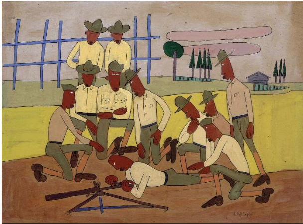
Lessons in a Soldier's Life , ca. 1942, William H. Johnson, tempera on paper, Smithsonian American Art Museum