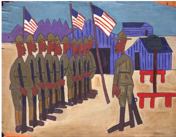
Soldiers Training , ca. 1942, William H. Johnson, oil on plywood, Smithsonian American Art Museum

While the fight for African American civil rights has been traditionally linked to the 1960s, the discriminatory experiences faced by black soldiers during World War II are often viewed by historians as the civil rights precursor to the 1960s movement. During the war America's dedication to its democratic ideals was tested, specifically in its treatment of its black soldiers. The hypocrisy of waging a war on fascism abroad, yet failing to provide equal rights back home was not lost. The onset of the war brought into sharp contrast the rights of white and black American citizens. Although free, African Americans had yet to achieve full equality. The discriminatory practices in the military regarding black involvement made this distinction abundantly clear. There were only four U.S. Army units under which African Americans could serve. Prior to 1940, thirty thousand blacks had tried to enlist in the Army, but were turned away. In the U.S. Navy, blacks were restricted to roles as messmen. They were excluded entirely from the Air Corps and the Marines. This level of inequality gave rise to black organizations and leaders who challenged the status quo, demanding greater involvement in the U.S. military and an end to the military's segregated racial practices.