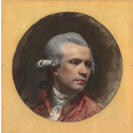
John Singleton Copley Self-Portrait, 1780-1784, National Portrait Gallery, Smithsonian Institution

affinity with Great Britain, it is not surprising that these colonists favored styles that were characteristically British, including the style of their portrait paintings.