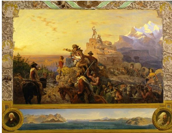
Westward the Course of Empire Takes Its Way (mural study, U.S. Capitol) , 1861, Emanuel Leutze, oil on canvas, Smithsonian American Art Museum

Emanuel Leutze painted Westward the Course of Empire Takes Its Way (mural study, U.S. Capitol) during one of the most tumultuous times in American history – the onset of the Civil War. The painting celebrates the belief that the American West held both unspoiled beauty and infinite promise for a better future. It advocates “manifest destiny,” the belief that it was America’s divinely ordained mission to settle and civilize the West – an alliance between nation-building and religion. What can we learn about the ideals surrounding westward expansion from this artwork? How do artists employ symbolism to augment a specific message in their work? Observing details and analyzing components of the painting and then placing them in